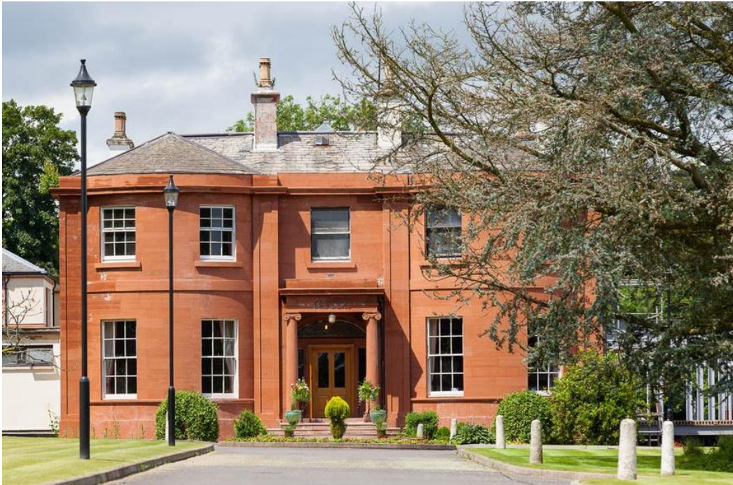
Woodlands House Hotel, Newbridge, Dumfries DG2 0HZ

There are two traditional Passage Controls – one in Scotland and one in England. These will be open one hour before the time indicated on the route.