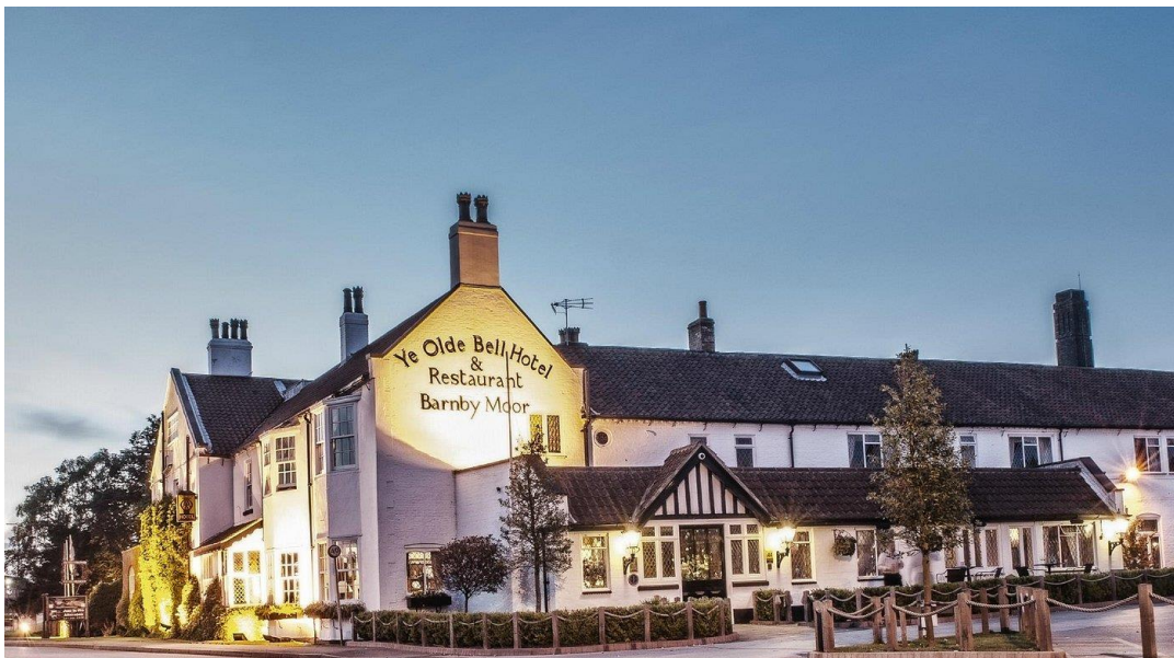
Ye Olde Bell Inn, Barnby Moor DN22 8QS

This Passage Control will be staffed by the South of Scotland Car Club.