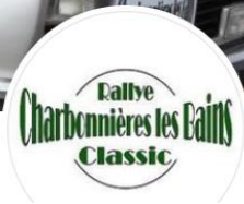
Rallye de Charbonnières Classic